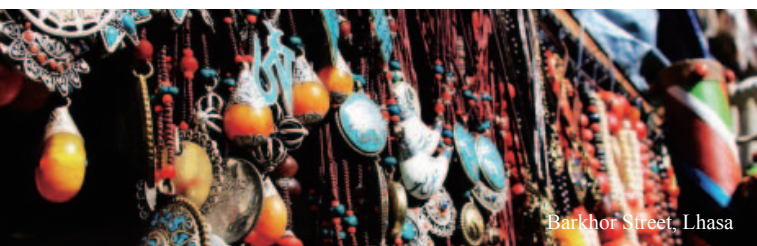
Barkhor Street, Lhasa

After breakfast, visit 【Norbulingka】 which means "precious garden" in Tibetan. It was the summer residence of many generations of Dalai Lamas, while Potala Palace was their winter residence. After lunch visit the biggest temple in Tibet-- 【Drepung Monastery】 which is known as the most important monastery of Gelugpa in Tibetan Buddhism. It is considered one of the "Three Great Monasteries" (the other two are the Ganden Monastery