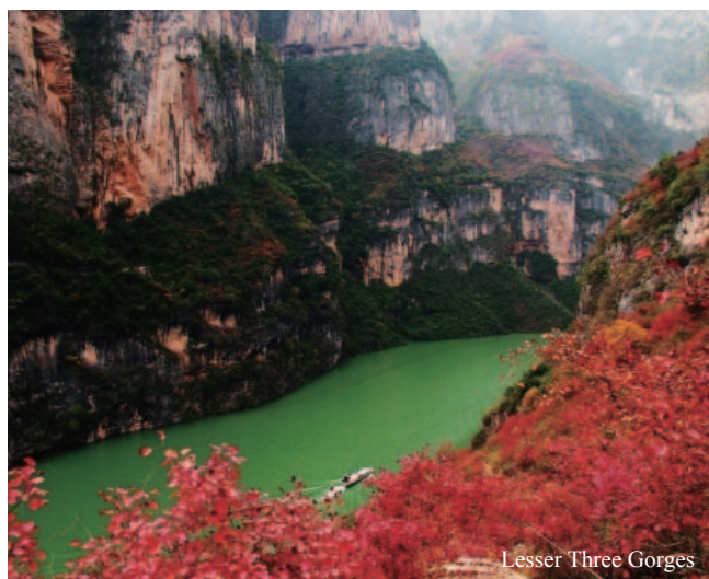
Lesser Three Gorges