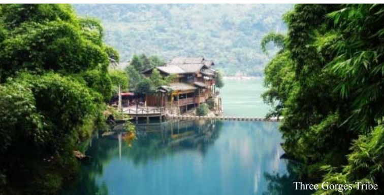
Three Gorges Tribe