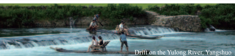
Drift on the Yulong River, Yangshuo

Shanghai: 5 ☆ Crowne Plaza Shanghai/similar